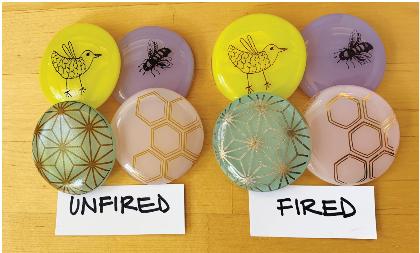
Above: Projects made with Fusible Decal Paper (7079) and pre-printed Milestone Decals (8596, 8697, 8698), shown with unfired and fired decals.