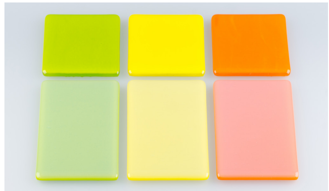
Medium Value Opalescent: Spring Green (000126-0030), Sunflower Yellow (000220-0030), Tangerine Orange (000025-0030)