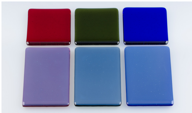
Dark Value Transparent: Red (001122-0030), Olive Green (001141-0030), Deep Royal Blue (001114-0030). These two photos show the same tiles. The image on the right is shown in transmitted light. The base color shows through.