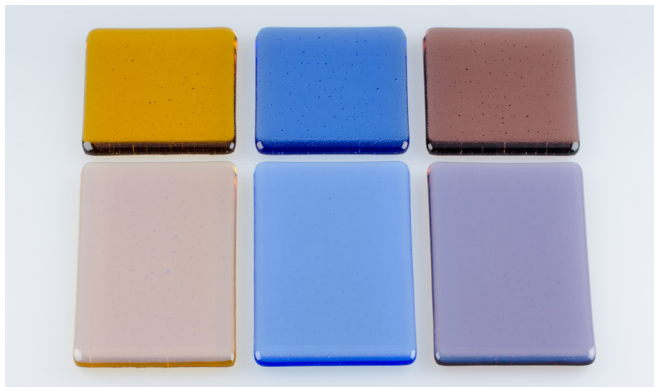
Medium Value Transparent: Medium Amber (001137-0030), Light Sky Blue (001414-0030), Light Plum (001405-0030)

The small tiles are uncapped, fired on a clear base. The large tiles are capped with Opaline (000403-0030). All shown in reflective light, unless noted.