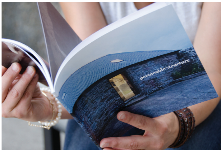
Permeable Structure 008660

Available in gauge sizes: Powder (-0008), Fine (-0001), Medium (-0002), Coarse (-0003). Sold in 5 oz., 1 lb., and 5 lb. jars