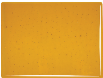
Dark Amber Transparent 001138-0030, -0050, -0031, -0051 (Price Code B)

Get inspired by the new glass styles—and a new book—we've added to the Bullseye product line!