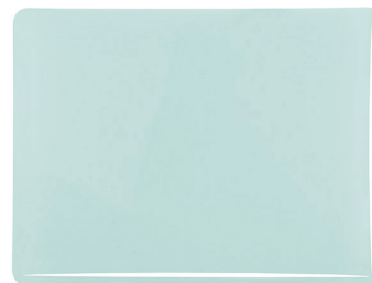
Robin's Egg Blue Opalescent 000161-0030, -0050 (Price Code B)