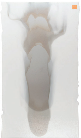
White, Light Silver Gray Cascade 002249-CA30 (Price Code C)

By popular demand, we're offering a non-iridized version of 2249-CA37.