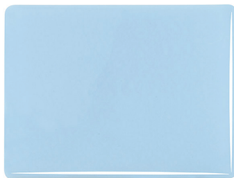
Glacier Blue Opalescent 000104-0030, -0050 (Price Code B)

Now available with with a gold irid coating. With 001429-37 and 001137-38, this style completes our silver/gold/bronze line.