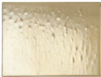
Light Bronze Transparent, Gold Irid 001409-0038 (Price Code B)

This style beautifully completes our Amber line, giving you light, medium, and now dark amber options.