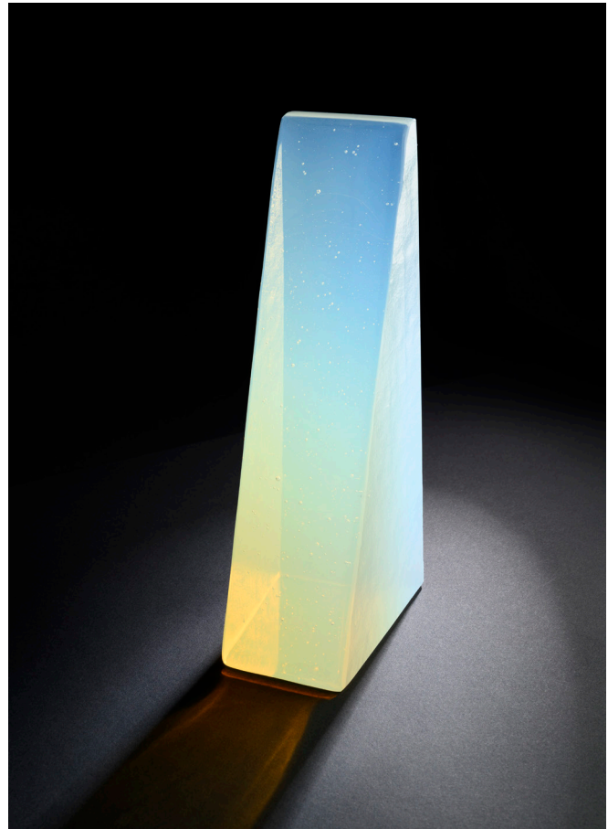
The above cast wedge was held for 8:00

*If your typical casting process includes a hold at 1225 °F (663 °C), when cooling from process temperature to reduce the probability of "suckers," you should still do this hold. In our tests, the glass did not develop any color/opalescence when held at this temperature upon cooling from the casting temperature. It will only develop color if first cooled to 1000 °F (538 °C), and then reheated as described above. We have not found it necessary to repeat the slower rate of cooling used to reduce suckers after your strike hold when cooling to anneal. For additional information about suckers, see Tip Sheet 8: Lost Wax Kilncasting .