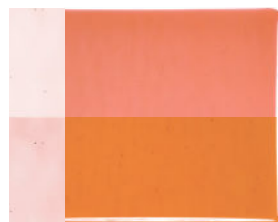
Sunset Coral 001305-0030, -0050 ● unstruck (left) and struck (right)