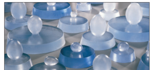
Steven Easton, Snow Queen's Realm II (detail), 2005. Pâte de verre, 5" x 36" x 84" (13 x 91 x 213 cm) installed.

Longini fired her tinted components to a low temperature, retaining a delicate, granular appearance.