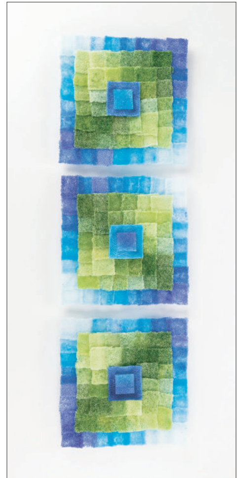
Susan Longini, Pieced Quilt Triptych , 2005. Pâte de verre, 36" x 11" x 2" (91 x 28 x 5 cm) installed.

Longini fired her tinted components to a low temperature, retaining a delicate, granular appearance.