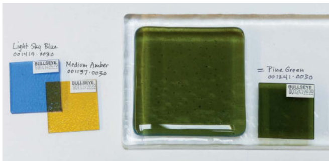
TOP: Light Sky Blue 001414-0030 BASE: Medium Amber 001137-0030. Tile shown elevated on a Clear billet for light transmission.