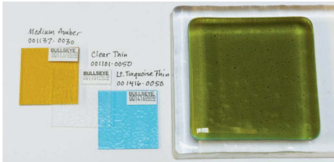
TOP: Medium Amber 001137-0030 MIDDLE: Clear Thin 001101-0050 * BASE: Light Turquoise Blue Thin 001416-0050. Tile shown elevated on a Clear billet for light transmission.