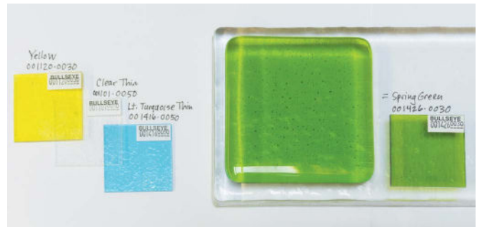
TOP: Yellow 001120-0030 MIDDLE: Clear Thin 001101-0050 * BASE: Light Turquoise Blue Thin 001416-0050. Tile shown elevated on a Clear billet for light transmission.