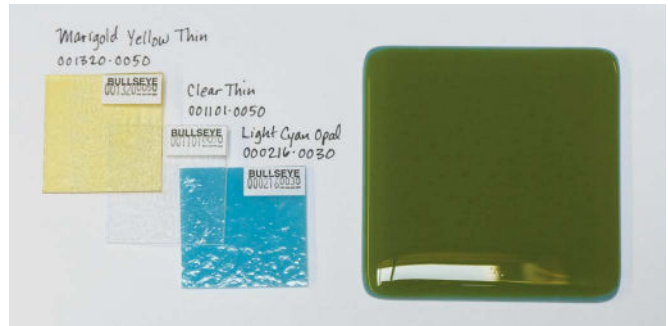
TOP: Marigold Yellow Thin 001320-0050 MIDDLE: Clear Thin 001101-0050 * BASE: Light Cyan Opal 000216-0030.