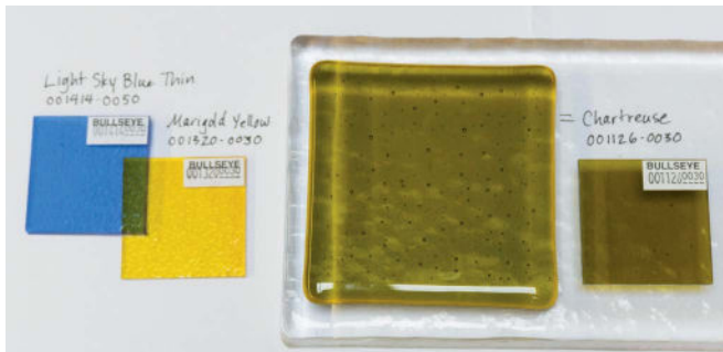
TOP: Light Sky Blue Thin 001414-0050 BASE: Marigold Yellow 001320-0030. Tile shown elevated on a Clear billet for light transmission.