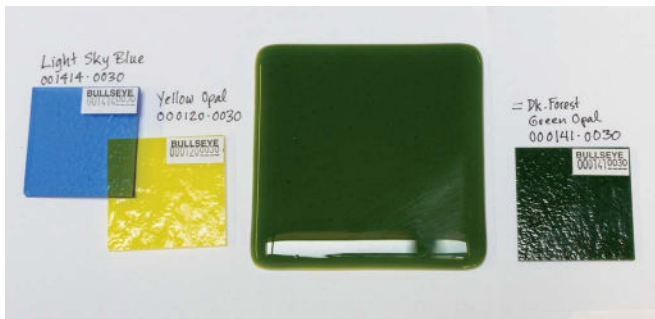
TOP: Light Sky Blue 001414-0030 BASE: Canary Yellow Opal 000120-0030

*Requires Clear Thin between colors to prevent a dark color reaction.