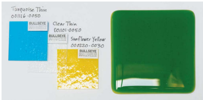
TOP: Turquoise Blue Thin 001116-0050 MIDDLE: Clear Thin 001101-0050 * BASE: Sunflower Yellow Opal 000220-0030.