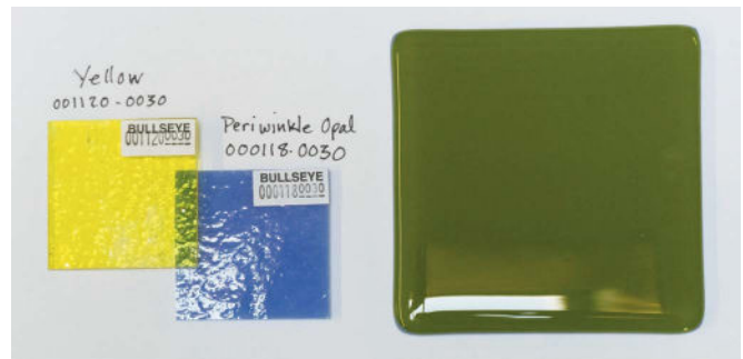
TOP: Yellow 001120-0030 BASE: Periwinkle Opal 000118-0030