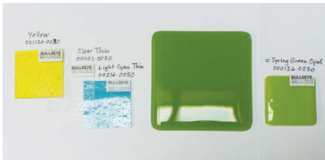
TOP: Yellow 001120-0030 MIDDLE: Clear Thin 001101-0050 * BASE: Light Cyan Opal Thin 000216-0050.