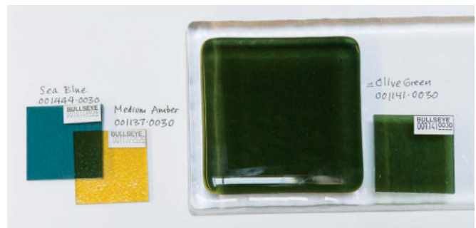
TOP: Sea Blue 001444-0030 BASE: Medium Amber 001137-0030. Tile shown elevated on a Clear billet for light transmission.