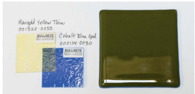
TOP: Marigold Yellow Thin 001320-0050 MIDDLE: Clear Thin 001101-0050 * BASE: Cobalt Blue Opal 000114-0030