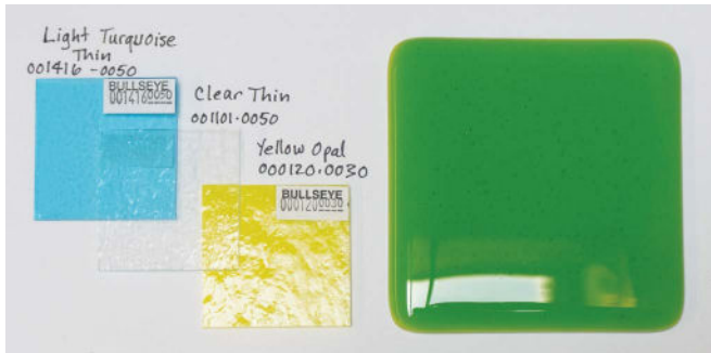
TOP: Light Turquoise Blue Thin 001416-0050 MIDDLE: Clear Thin 001101-0050 * BASE: Canary Yellow Opal 000120-0030.

How to make green from other colors of Bullseye glass.