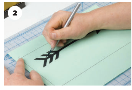
To make this design, we started with an image on paper and cut it out to make a stencil.

Plan a design based on the billet dimensions, approximately 10" × 5" × 0.75" (127 × 254 × 19 mm).