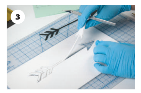
Trace the design onto 1/8 " Fiber Paper (7036) and cut it out using an X-Acto knife. For a raised design, oversize the fiber paper by 0.5" on each side to keep the billet from flowing over the edge.