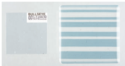
Indigo Tint (001818-0030)

(right) are darker than the thinner 3 mm flat sheet samples (left), producing new depths of color. Your palette just multiplied!