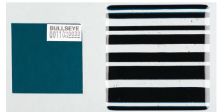
Aquamarine Blue (001108-0030)