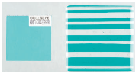
Light Aquamarine Blue (001408-0030)