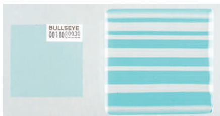
Aqua Blue Tint (001808-0030)