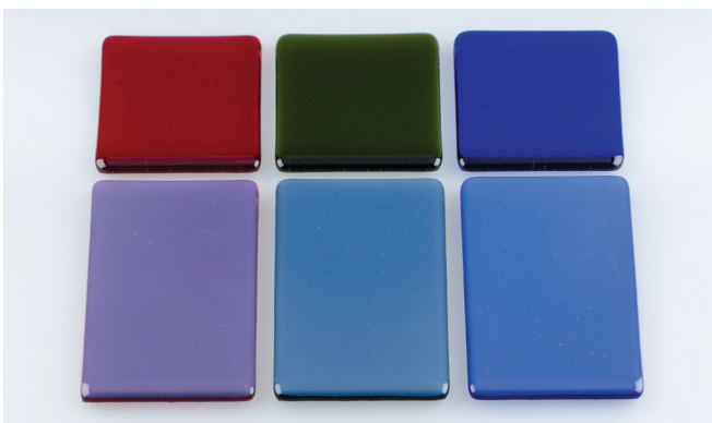
Dark Value Transparent: Red (001122-0030), Olive Green (001141-0030), Deep Royal Blue (001114-0030).