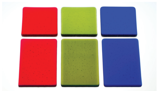
At left and above: These photos show the same tiles. The image above is shown in transmitted light. The base color shows through.