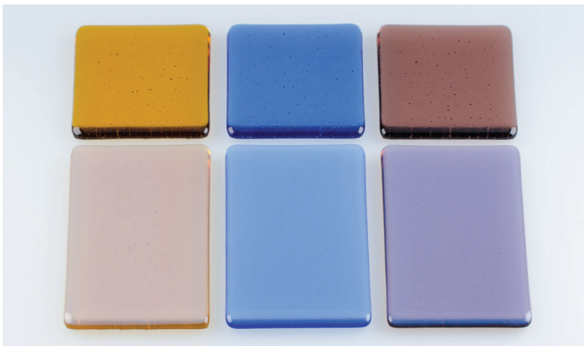
Medium Value Transparent: Medium Amber (001137-0030), Light Sky Blue (001414-0030), Light Plum (001405-0030).

The small tiles are uncapped, fired on a clear base. The large tiles are capped with Opaline (000403-0030). All shown in reflected light, unless noted.