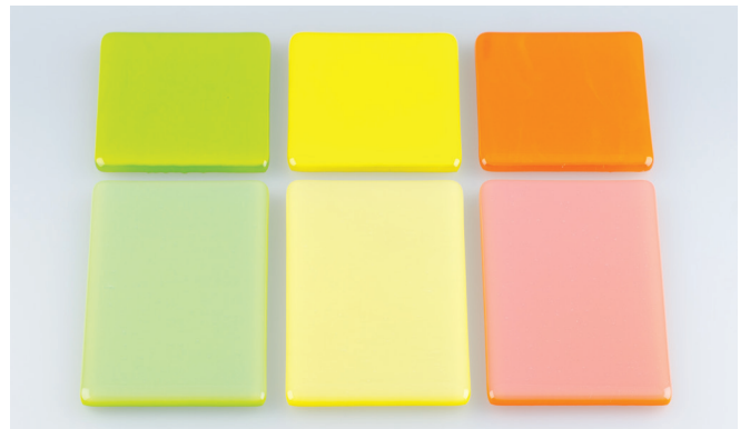
Medium Value Opalescent: Spring Green (000126-0030), Sunflower Yellow (000220-0030), Tangerine Orange (000025-0030).