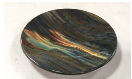
BASE: Tekta Clear (001101-0030); CAP: Petrified Wood (002971-0030) with Clear Frit (001101-0003 & -0005) on top. MOLD: Round Slumper (008630.)