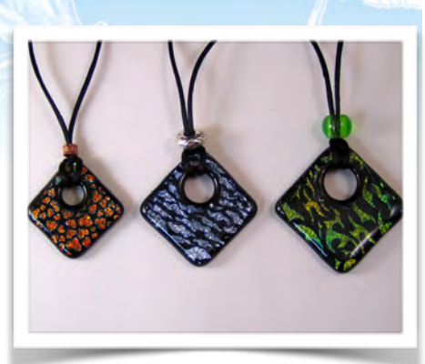
Medium clear frit <u>over</u> dichroic patterns on black glass.