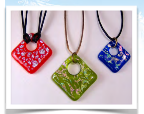
Fine, colored frit placed <u>under</u> dichroic patterns on clear glass.