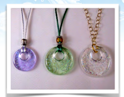
Medium, colored transparent frit <u>over</u> dichroic patterns on clear glass.