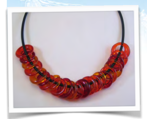
Small Ring Beads made wonky with one to two grams of frit