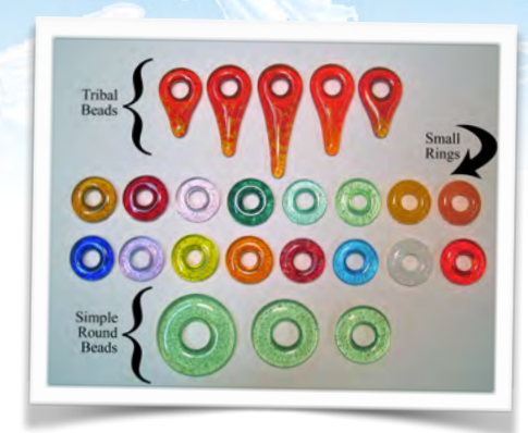
A chart showing castings from three Colour de Verre jewelry designs.